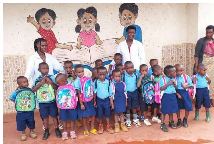
Children after distribution of the school kit gifted by Harmonious Initiative-France