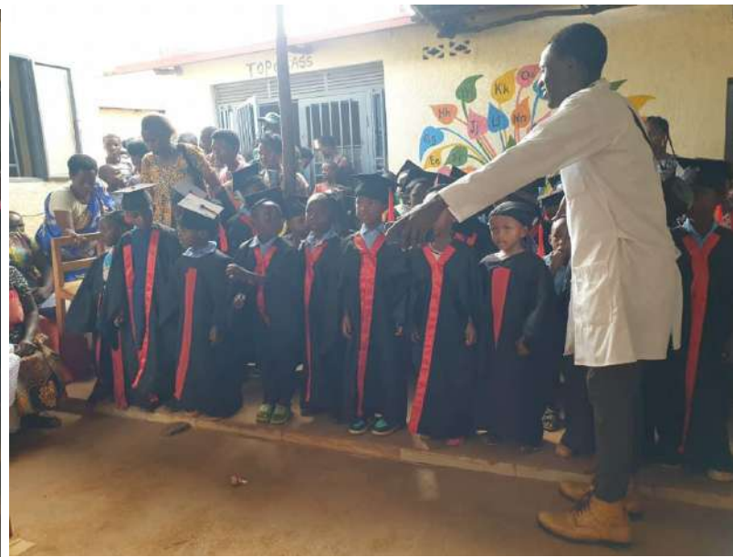
Top Class Graduation