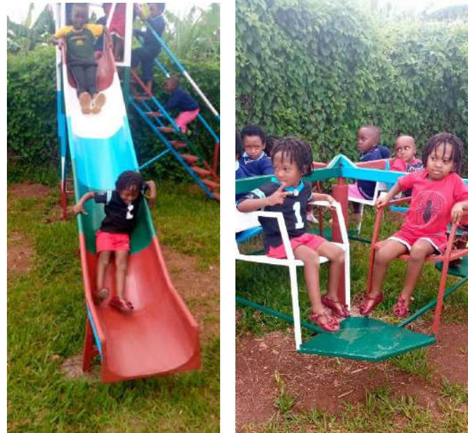
Figure 5: Socialization time in Play Park