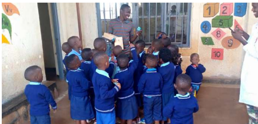
Children were given deworm pills by Janjagiro health Centre

Beside the ECD collaborate with local authorities to know the less privileged families that can be helped to get “Mutuelle de Santé” that are given by Harmonious Initiative, an International NGO with Headquarters in France and supporting different schools in Rwanda. In partnership with Harmonious initiative we have paid health insurance of 30 members within families of children enrolled in Hope Growers ECD Centre and 20 school materials including school bags, books and other materials.