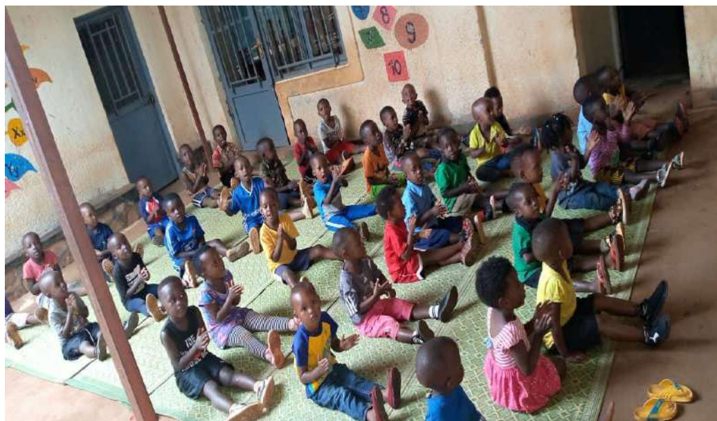
Figure 6: ECD Centre Children in praying session