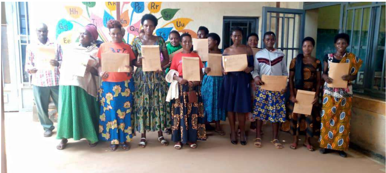
Parents who signed contracts with Hope growers for rabbits rearing

babby rabbits to other parents in the framework of corporate social responsibility.