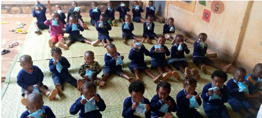
Figure 4: Milking Children