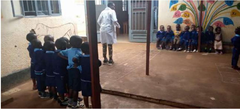
Figure 2: Morning sessions