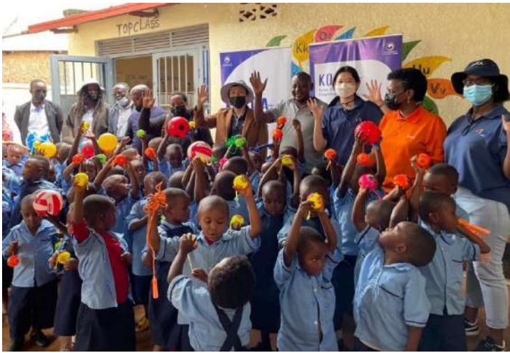
Figure 2: Mobilization activity in photos at the ECD center