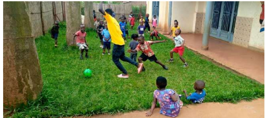
Figure 3: Children in physical activities